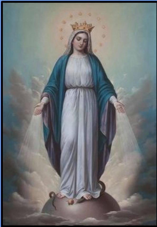
Our Lady of Grace.